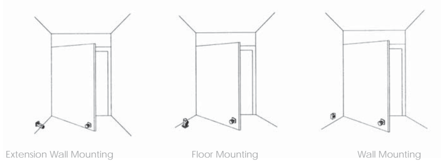
Extension Wall Mounting